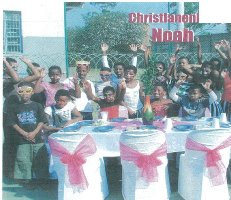
Annual Christmas Party specially arranged for orphans and destitute children. Students from Christianenburg, Udomo, and Clearnaville attended the party