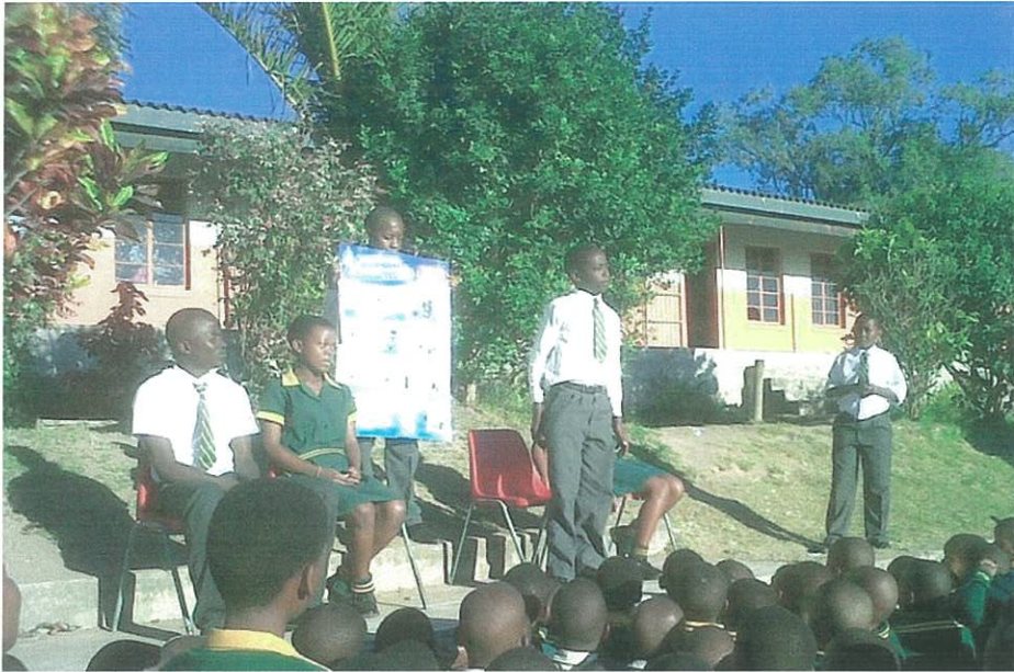
7 th Graders who attended “2011 African Children Conference on Environment” share their experience with fellow students and teachers